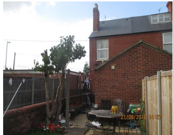
View of site from rear garden of no. 145 Queens Road