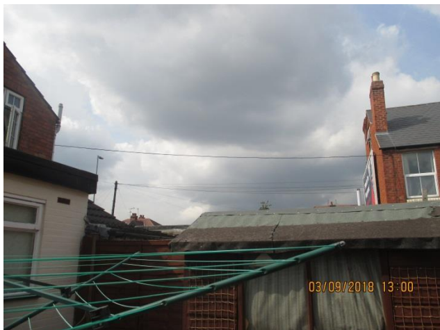
View of site from rear garden of no. 3 Hawthorn Grove