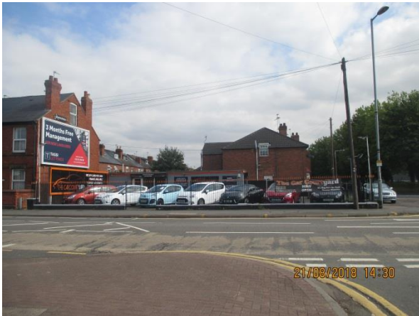
View of north west site boundary, looking towards no. 1 Hawthorn Grove with no. 145 Queens Road on left